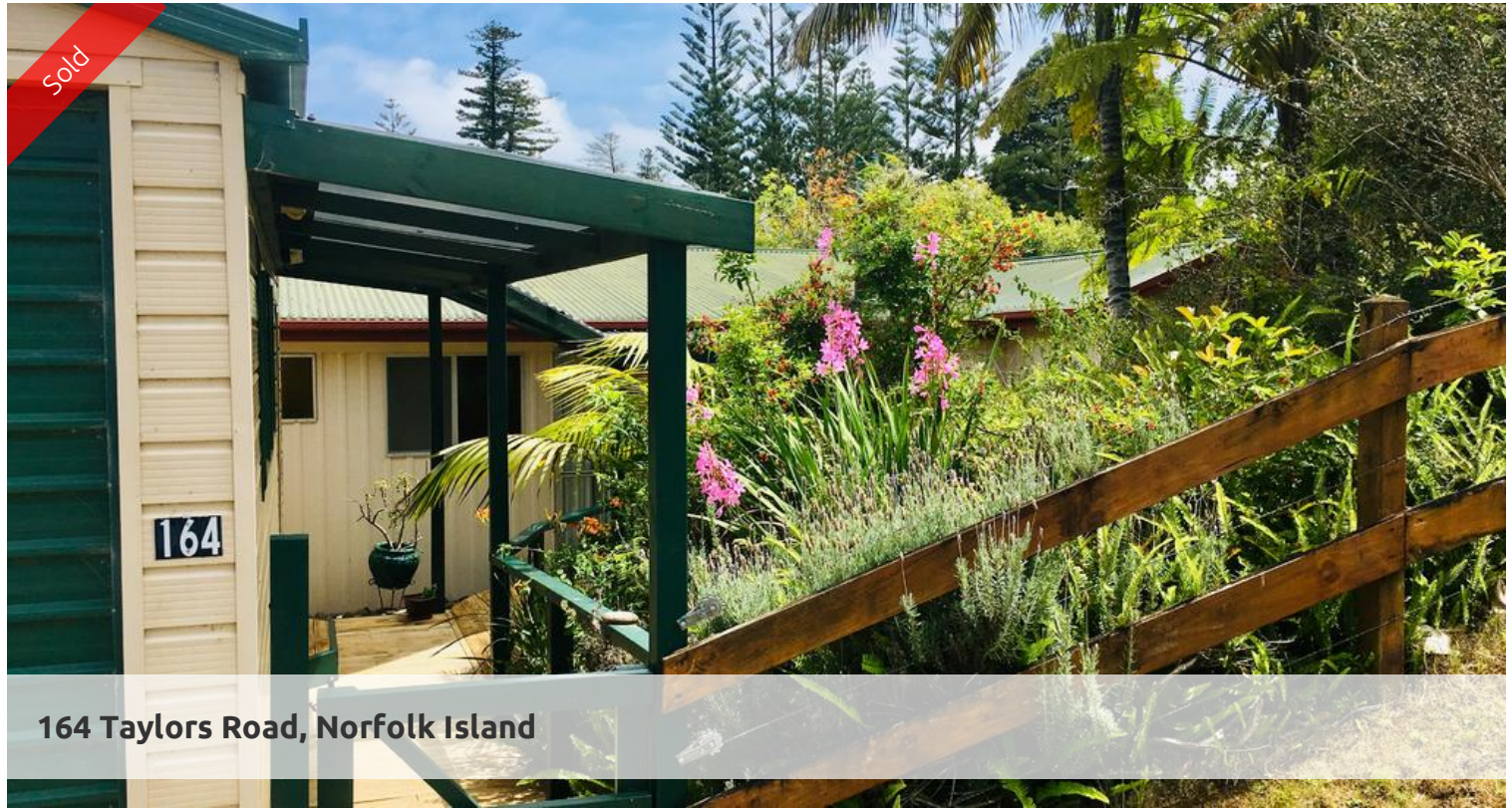
164 Taylors Road, Norfolk Island