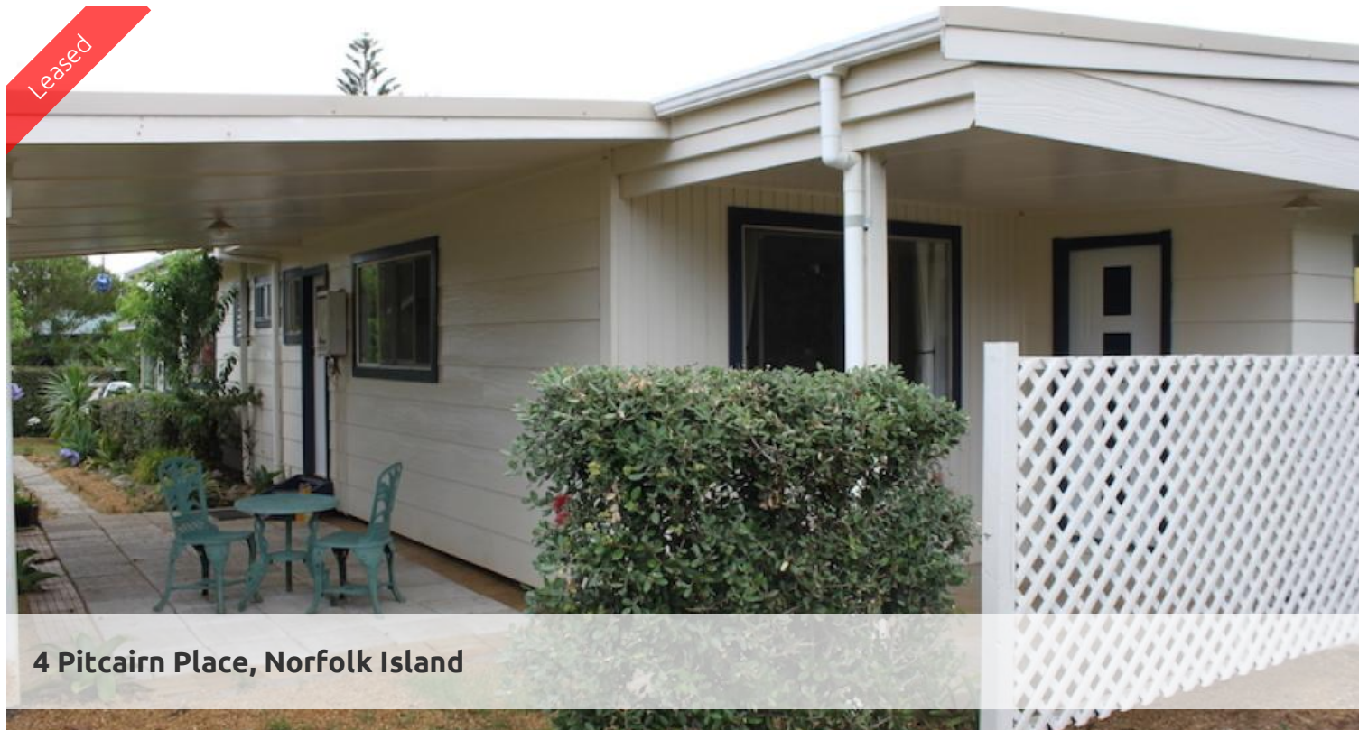
4 Pitcairn Place, Norfolk Island