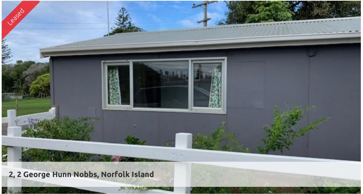
2, 2 George Hunn Nobbs, Norfolk Island