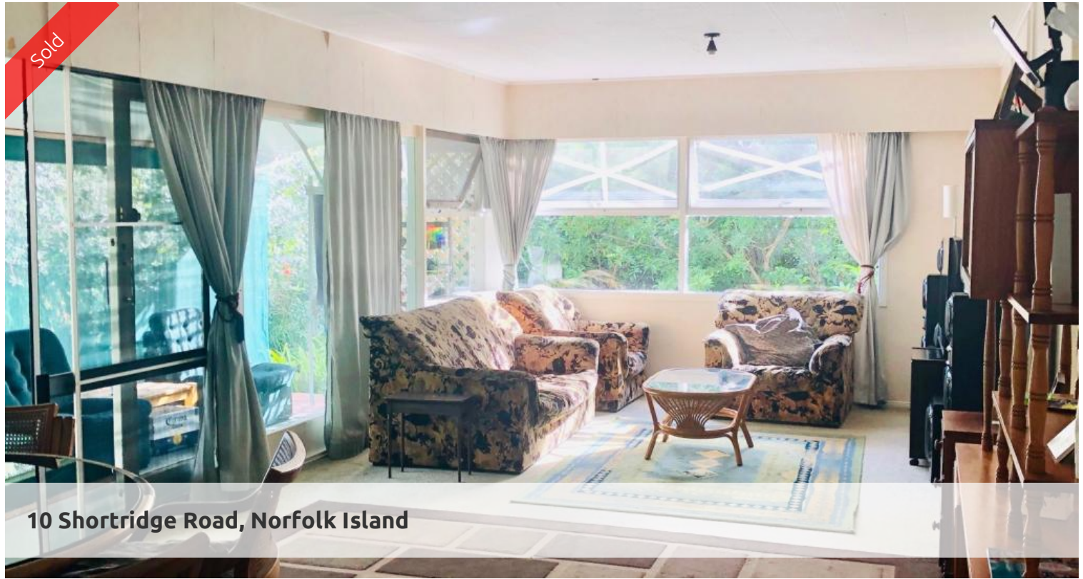
10 Shortridge Road, Norfolk Island