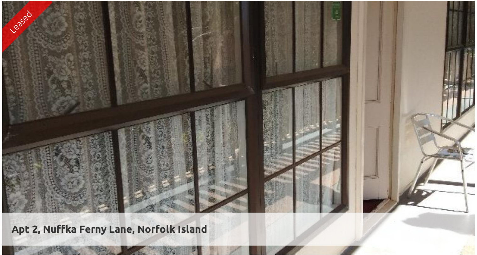
Apt 2, Nuffka Ferny Lane, Norfolk Island