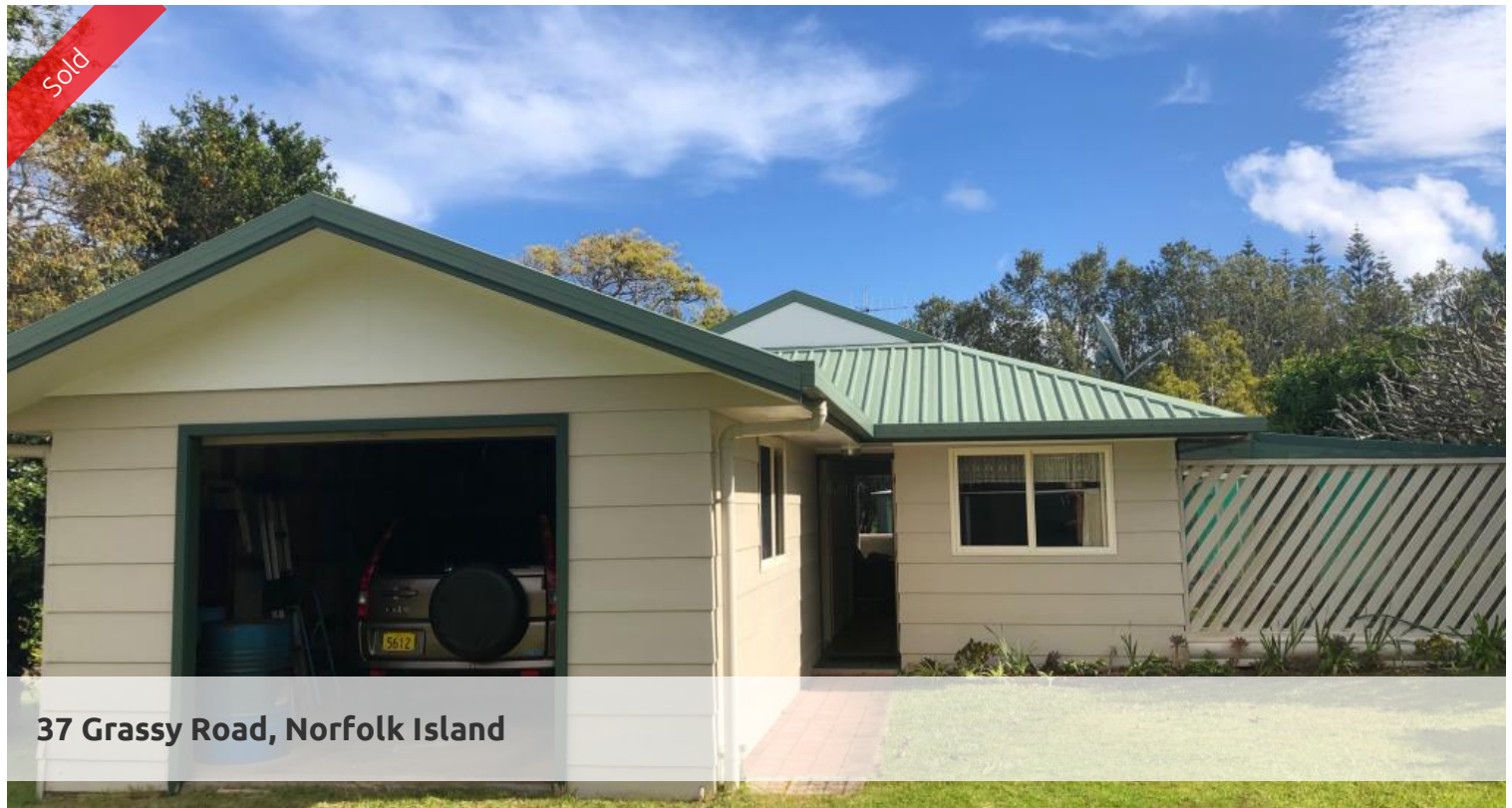
37 Grassy Road, Norfolk Island