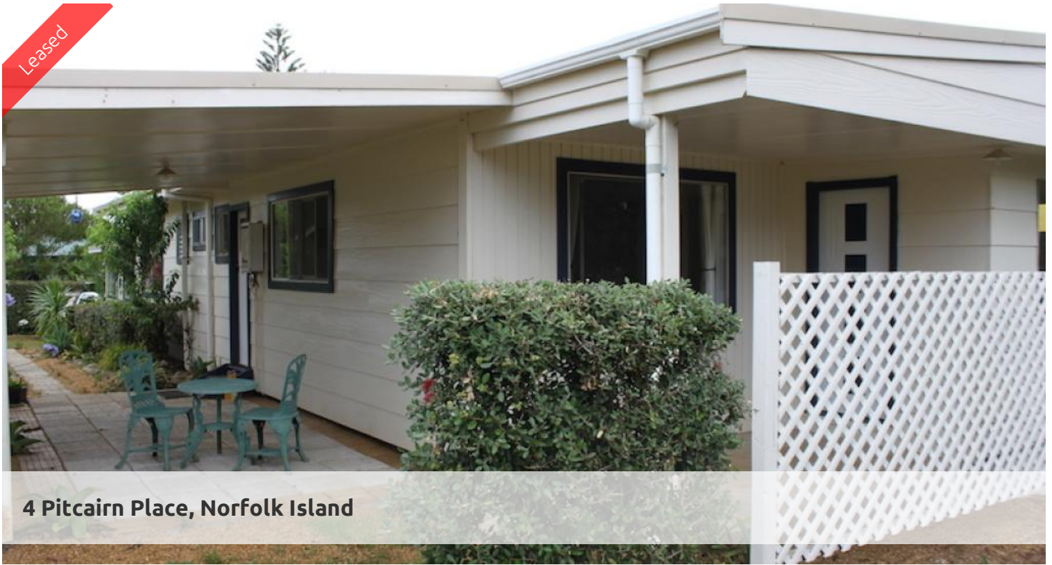
4 Pitcairn Place, Norfolk Island