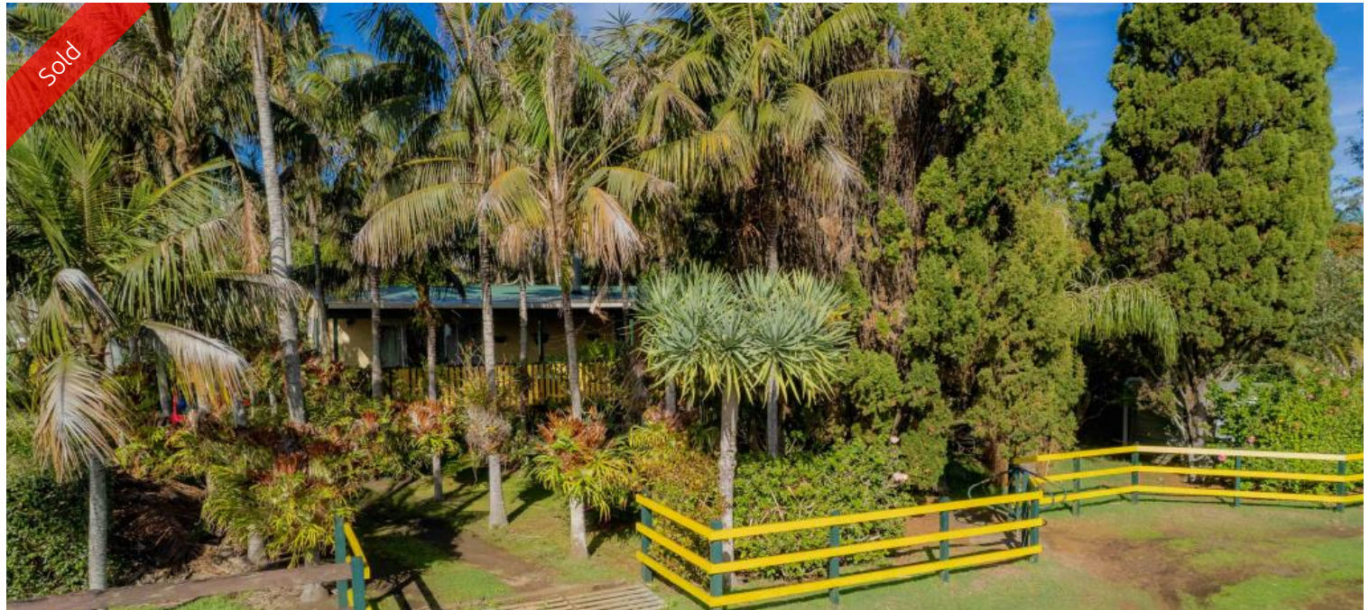
14 Shortridge Road, Norfolk Island