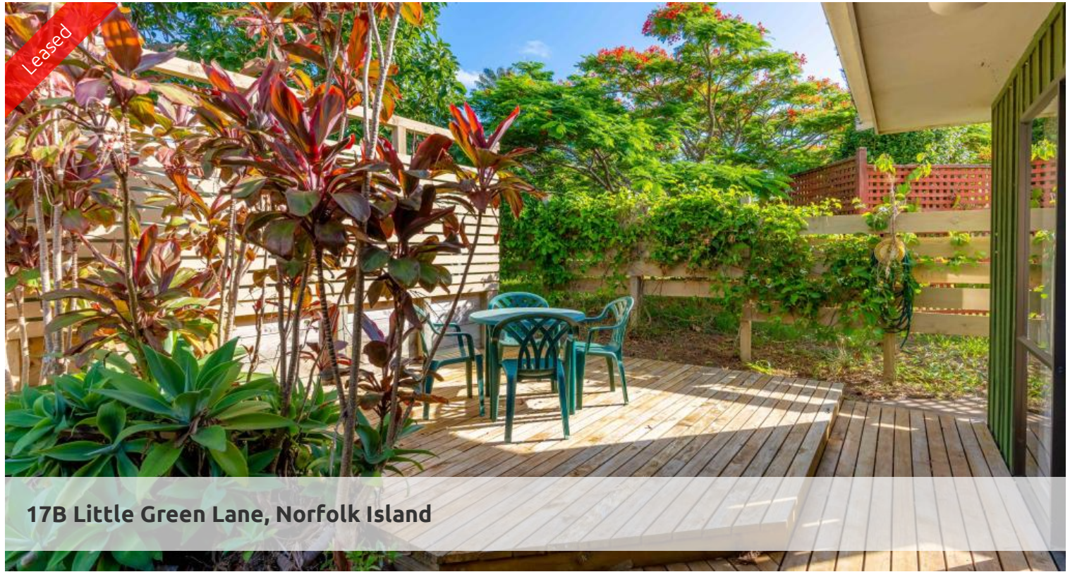
17B Little Green Lane, Norfolk Island