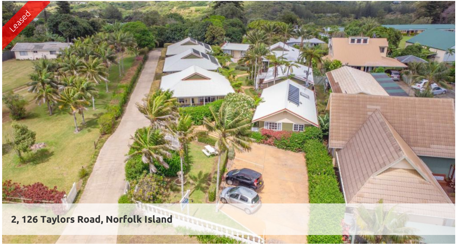
2, 126 Taylors Road, Norfolk Island