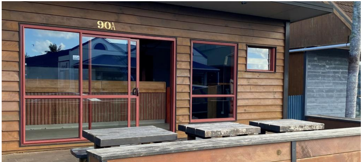
90A Taylors Road, Norfolk Island