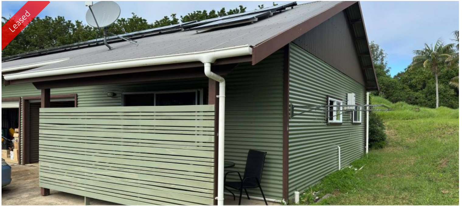
Moiras, 32 Calebs Lane, Norfolk Island